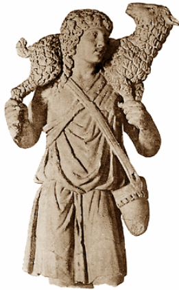
Luke 15: 4-6